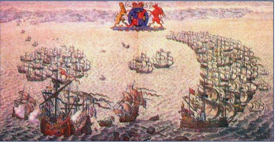
A contemporary illustration showing the Armada in crescent formation pursued down the Channel by the English Fleet of Lord Howard of Effingham

The Armada, followed closely by the ships of the English fleet, sailed toward the Strait of Dover. As long as the Armada kept its crescent shape it was very difficult for the English fleet to attack successfully. Constantly harassed, the slow moving Spanish Armada eventually reached Calais on August 6 without further loss. The Duke of Medina Sidonia, commander of the Armada, was now ready to meet up with the Spanish troops of the Duke of Parma at Dunkirk.