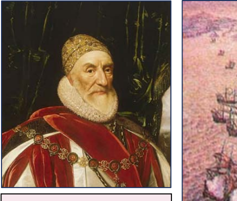
Admiral Lord Charles Howard c. 1620. Detail of a portrait by Daniel Mytens the Elder. (Note: Portrait painted around 32 years after the defeat of the Spanish Armada.)

whereas the Spanish used the wind to move quickly to the European mainland coastline where they would pick up the Duke of Parma's troops at Dunkirk, ready for the invasion of England.