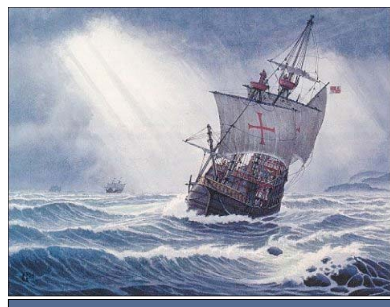
Spanish galleons in distress off Ireland, 1588

Instead of finding that the supposed God-saving Protestant Wind represents the Church on the Rock , it will be