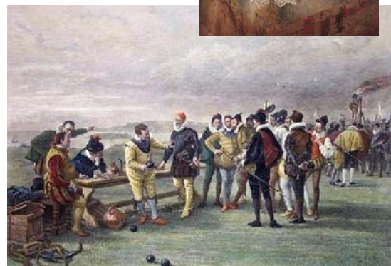
Drake playing bowls on Plymouth Hoe as the arrival of the Spanish Armada in the Channel is announced