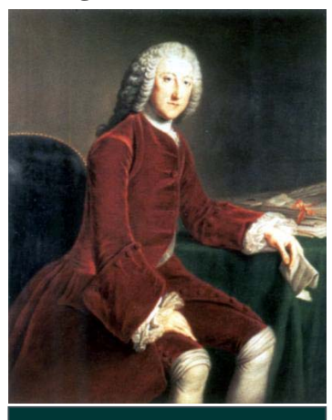
William Pitt, the Elder

Key Understanding: Double William Pitts . There were double 'risings' of Protestant England out of the Netherlands – through the defeat of the Spanish Armada in 1588 and the