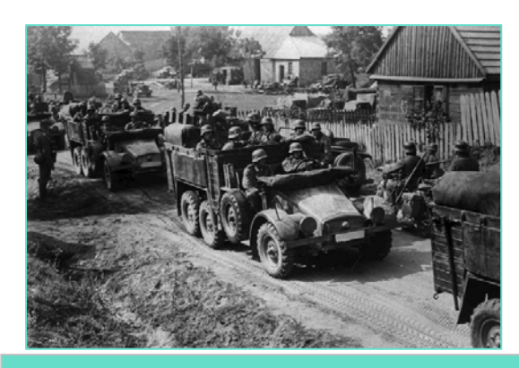
Germany invaded Poland on September 1, 1939

The Phony War phase of World War II would end a few months later on May 10, 1940, with the beginning of Hitler's invasion of Belgium, Luxembourg, the Netherlands, and France. The war was then for real. Winston Churchill became the Prime Minister of Great Britain the same day.