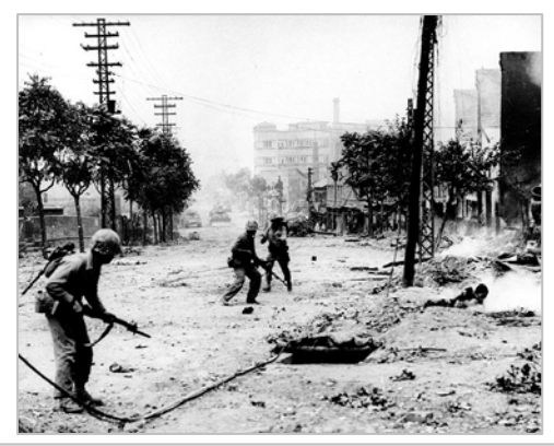
Urban combat in Seoul, 1950, as U.S. Marines fight North Koreans holding the city

The United States, which had withdrawn almost all its forces from Korea to Japan in the previous two years, immediately sent them back and rallied support from the United Nations. An international force of 16 countries, including Turkey, Australia, Greece, New Zealand, and Britain, fought alongside the U.S. and South Korean forces.