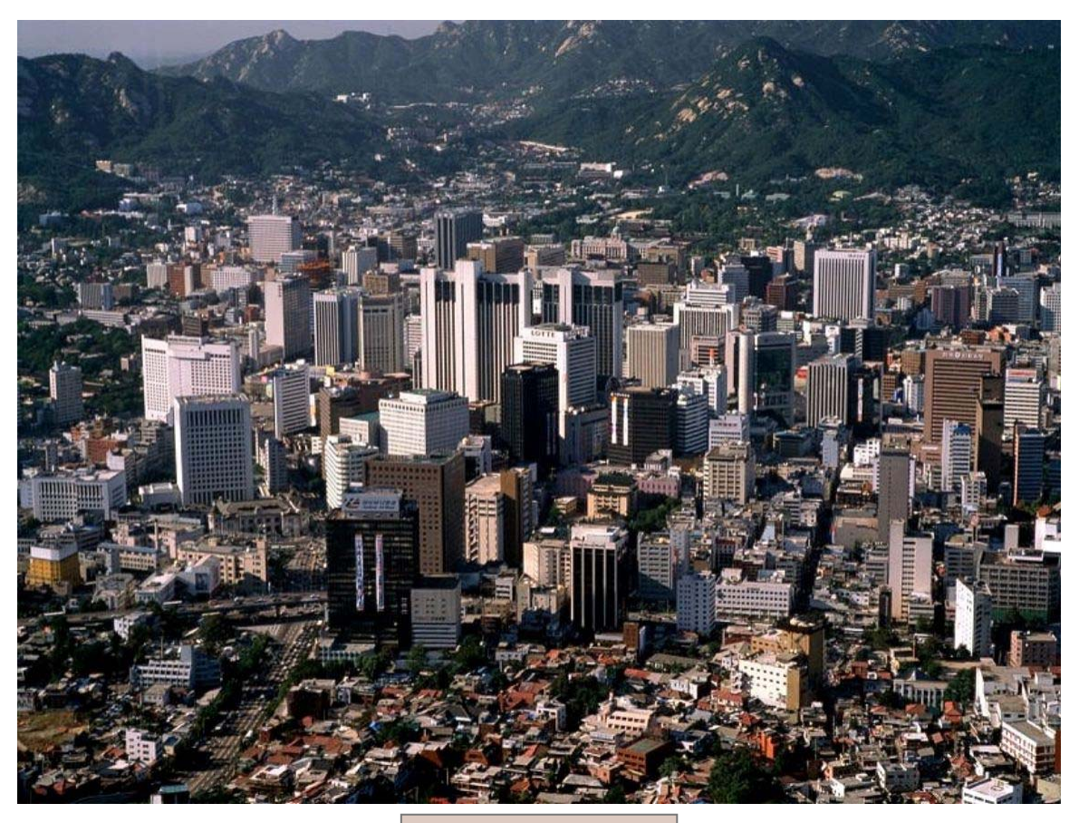
Seoul, South Korea

Daniel 7:21 (KJV) I beheld, and <u>THE SAME HORN</u> [the Daniel 7:8 Little Horn Nation of America] <u>MADE WAR WITH THE</u> [Church-ill] <u>SAINTS</u>, and <u>PREVAILED AGAINST</u> <u>THEM</u>;