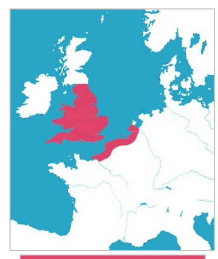
287 – The Empire of Carausius

Revelation 6:2 (KJV) And I saw, and behold <u>A WHITE</u> <u>HORSE</u>: and <u>HE</u> [Constantine the Great] <u>THAT SAT ON</u> <u>HIM HAD A BOW</u>; and <u>A CROWN WAS GIVEN</u> <u>UNTO HIM</u>: and <u>HE WENT FORTH CONQUERING</u>, AND TO CONQUER.