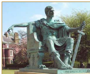
The spirit of Constantine represented the spirit of the Laodicean Church

The spirit of the church reigning on the earth with sword-bearing Constantine, through the Second Rome Christian Autocracy , carried through all the way to the end of the Third Rome Romanov Dynasty . That spirit was the same as the spirit of the church reigning with Woodrow Wilson’s sword-bearing Fourth Rome Christian Democracy , whose purpose it was to “Make the World Safe for Democracy,” and which clearly represented the Laodicean Church of “People’s Rights.”