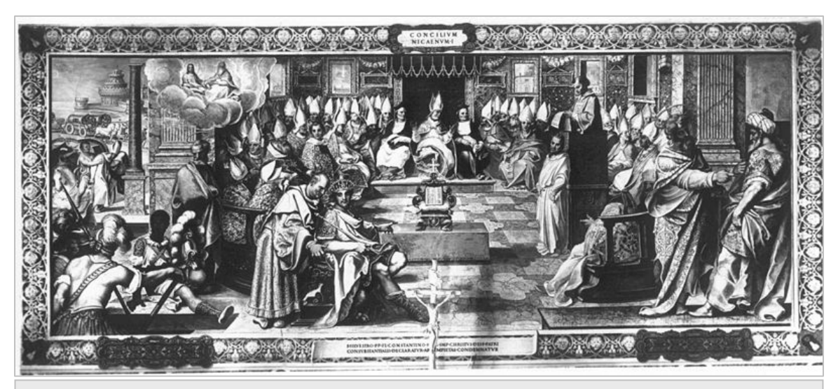
The Council of Nicaea fresco in the Sistine Salon Vatican, showing Constantine the Great presiding