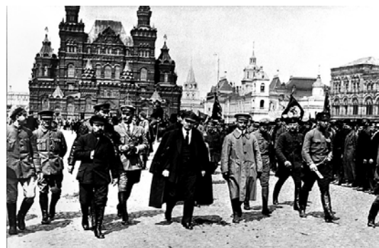
V. I. Lenin, joined by his military commanders, marches through Red Square

Revelation 6:3-4 (KJV) And when he had opened THE SECOND SEAL , I heard the second beast say, Come and see. 4 And there went out ANOTHER HORSE THAT WAS RED : and power was given to him that sat thereon to take peace from the earth, and that they should kill one another: and there was given unto him a great sword.