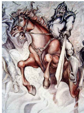
Red Horse Rider

Revelation 6:3-4 (KJV) And when he had opened THE SECOND SEAL , I heard the second beast say, Come and see. 4 And there went out ANOTHER HORSE THAT WAS RED : and power was given to him that sat thereon to take peace from the earth, and that they should kill one another: and there was given unto him a great sword.