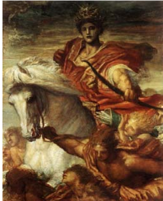
White Horse Rider

Revelation 6:2 (KJV) And I saw, and behold A WHITE HORSE : and HE THAT SAT ON HIM [Woodrow Wilson – and we can call his horse Man o’ War ] HAD A BOW ; and a crown was given unto him: and HE WENT FORTH CONQUERING, AND TO CONQUER.