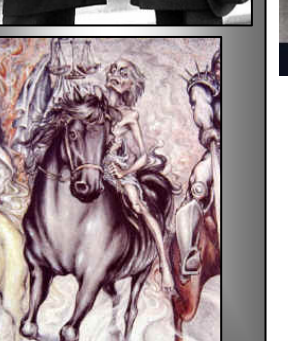
The Black Horse Rider