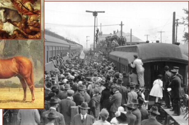
Sending men off to fight in World War I