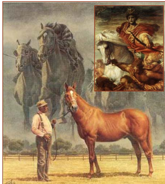
'Big Red' Man o' War represents the Revelation 6:2 white horse ( inset )

Key Understanding: Why 'Big Red' Man o' War represents the Revelation 6:2 white horse. The answer is that since the Red Horse Rider Soviet Union is to the United States what the United States is to the Lord (reference recent Unsealing #819 ), the Lord had 'Big Red' Man o' War represent the Scarlet Beast United States in its Woodrow Wilson-led Revelation 6:2 White Horse Rider counterfeit of the Revelation 19:11 White Horse Rider, Jesus Christ.