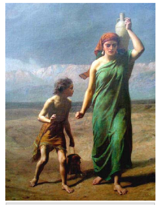
Ishmael and Hagar

11 And the angel of the LORD said unto her, Behold, thou art with child, and shalt bear a son, and shalt