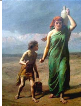
Ishmael and Hagar

Genesis 16:16 (KJV) AND ABRAM WAS FOURSCORE AND SIX YEARS OLD, WHEN HAGAR BARE ISHMAEL TO ABRAM.