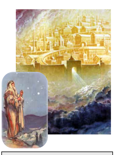
Represented by Abraham and Hebrews 11:10

who are called to be (i) citizens of heaven (represented by Abraham) from those who essentially are (ii)