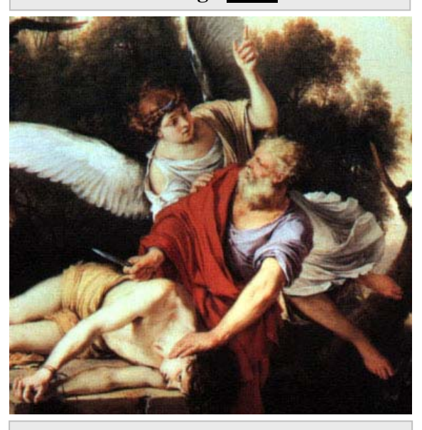
Abraham offering up Isaac

Hebrews 11:8-19 represents the seed of Abraham through <u>Isaac</u>