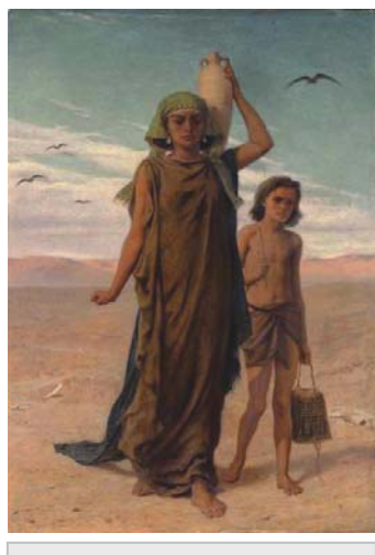
Hagar and Ishmael

<u>Four score and six years old</u> – The age of Abram at the birth of Ishmael, and the age of the United States at the July 1-3, 1863, Battle of Gettysburg, meaning that Abraham Lincoln's "<u>new birth</u> of freedom" was represented by the <u>birth</u> of Ishmael.