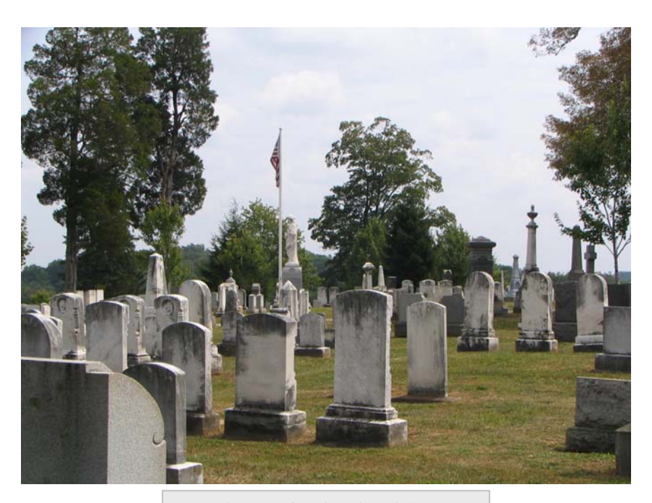
Gettysburg National Park and Cemetery