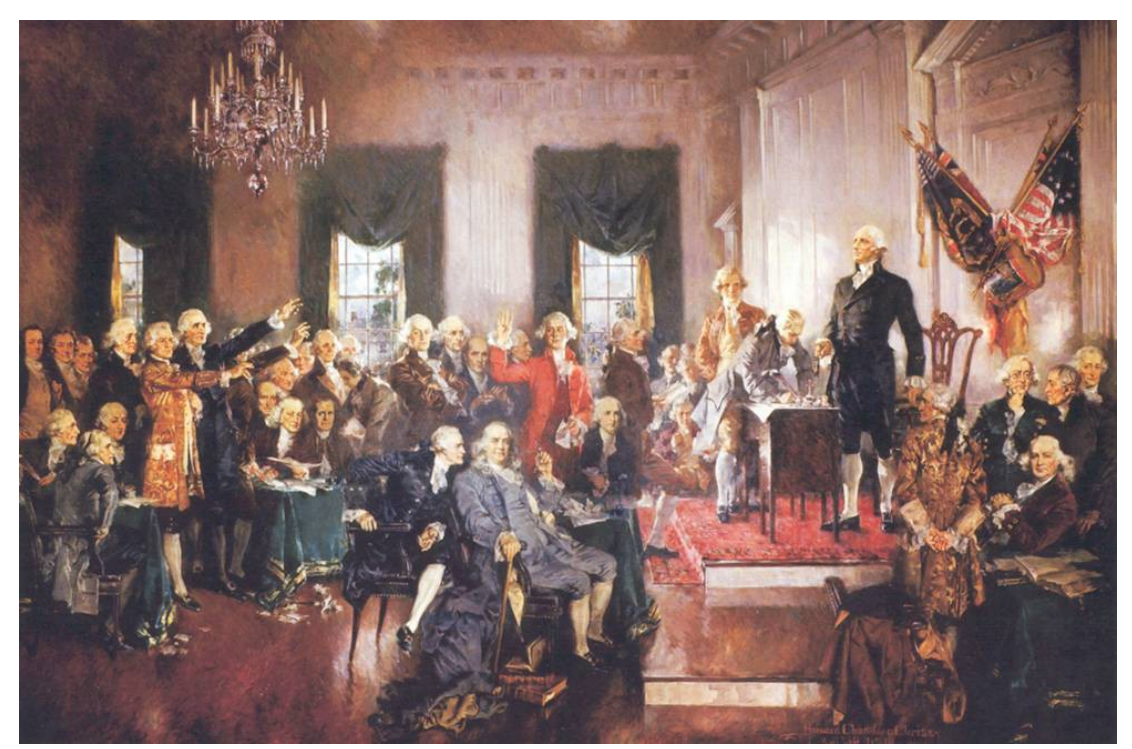
The famous painting of the scene at the signing of the Constitution at the U.S. Constitutional Convention shows convention president George Washington standing on the dias, and Benjamin Franklin prominently sitting (in the center) , illustrative of his substantial role.

Key Understanding: The ironic counterfeit of "the mind which hath wisdom" of Revelation 17:09. Benjamin Franklin was the mind which had wisdom above all other Americans in the history and folklore of the nation. The Lord ordained Benjamin Franklin – who as the mind which had [human] wisdom played key roles in the birthing of the Beast, the Eighth – to be born in 1706 [= 1709] to specifically fulfill Revelation 17:09 as the ironic counterfeit of