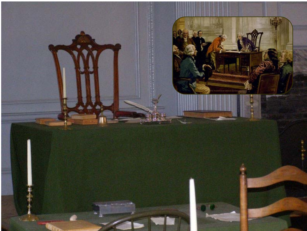
George Washington sat in this ‘rising sun’ armchair as President of the U.S. Constitutional Convention, to fulfill prophecy as the counterfeit rising son of Isaiah 9:6 that would have the government upon his shoulder

Isaiah 9:6 (KJV) For unto us a child is born, UNTO US A SON IS GIVEN [the first part of this verse has to do with the First Coming of the Son of God, Jesus Christ]: and THE GOVERNMENT SHALL BE UPON HIS SHOULDER [and this part of the verse has to do with the Second Coming of the Son of God, Jesus Christ]: and his name shall be called Wonderful, Counsellor, The mighty God, The everlasting Father, The Prince of Peace.