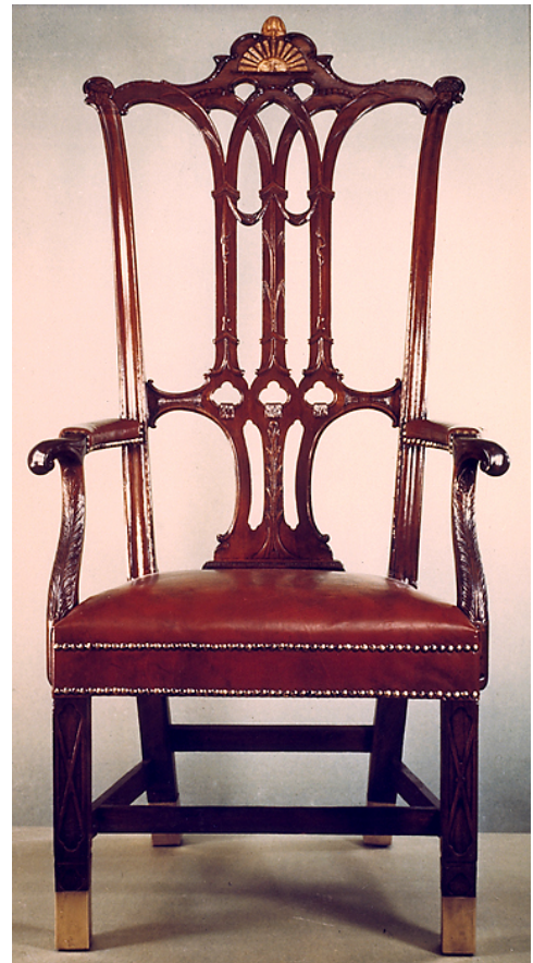
George Washington used the ‘rising sun’ chair ( shown above ) for nearly three months of the continuous sessions of the U.S. Constitutional Convention

The Sun representing the Son. In virtually every culture historically, and generally in association with paganism (but also in scripture, Malachi 4:2), the sun figuratively represents a son , usually a deified son. In fact, the birth of the Son of God, Jesus Christ, is incorrectly celebrated by the world on Christmas Day, December 25, because it originated as a substitute for the