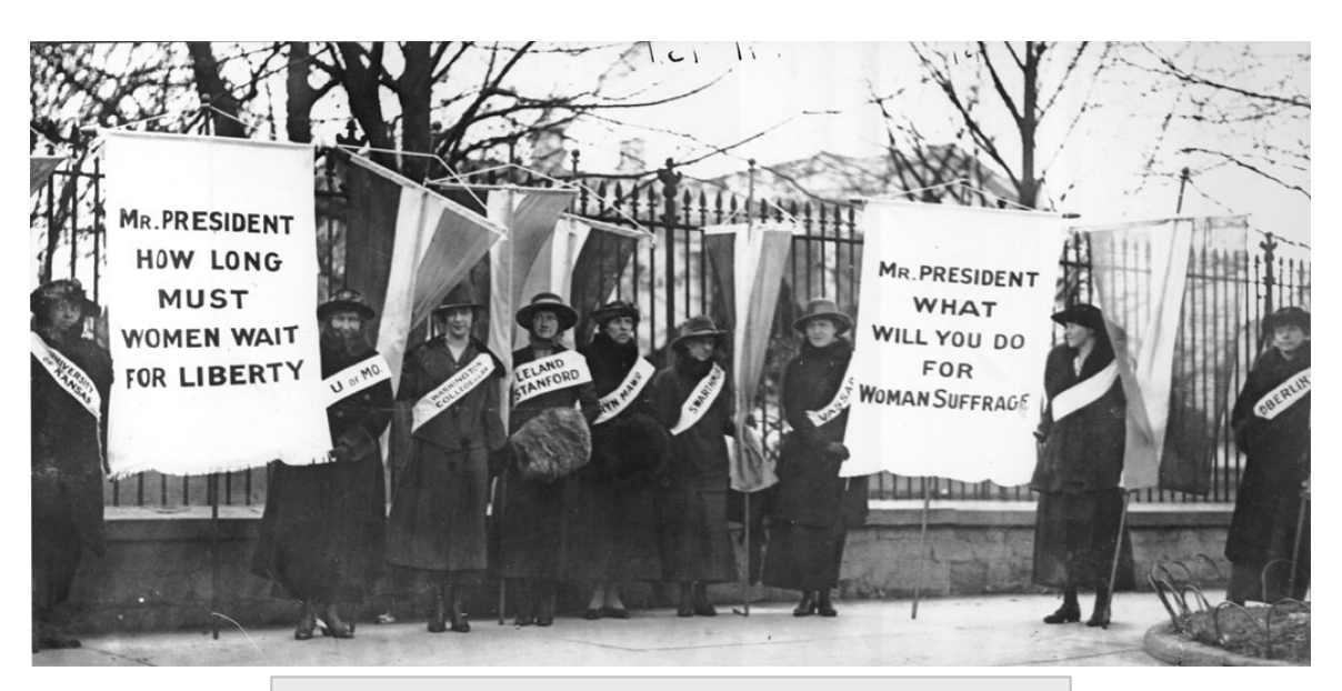
Women picketing outside the White House during World War I

Key Understanding: The <u>Woman</u> of Revelation 17:18 is tied to <u>Babel</u> of Genesis 11:1 because (a) the 19<sup>th</sup> Amendment giving <u>women the right to vote</u> (and representing the <u>Woman</u>) finally came to fruition, due to (b) militant suffragists successfully challenging the hypocrisy of Woodrow Wilson's World War I goal of Making the World Safe for Democracy (the worldwide Second <u>Babel</u>), when American <u>women</u> themselves did not yet have the right to vote.