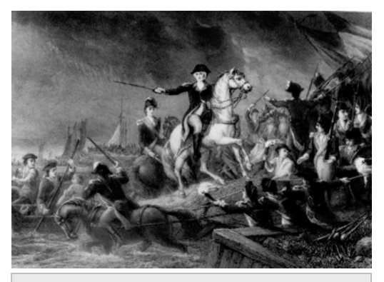
Retreat at Long Island

The Battle of Long Island, also known as the Battle of Brooklyn, fought on August 27, 1776, was the first major battle of the American Revolutionary War following the United States Declaration of Independence. It was the largest battle of the entire conflict, and the first battle an army of the United States ever engaged in. The battle and its immediate aftermath were marked by the British capture of New York City, which they subsequently held for the entire war. In the weeks that followed the Battle of Brooklyn, British forces occupied Long Island.