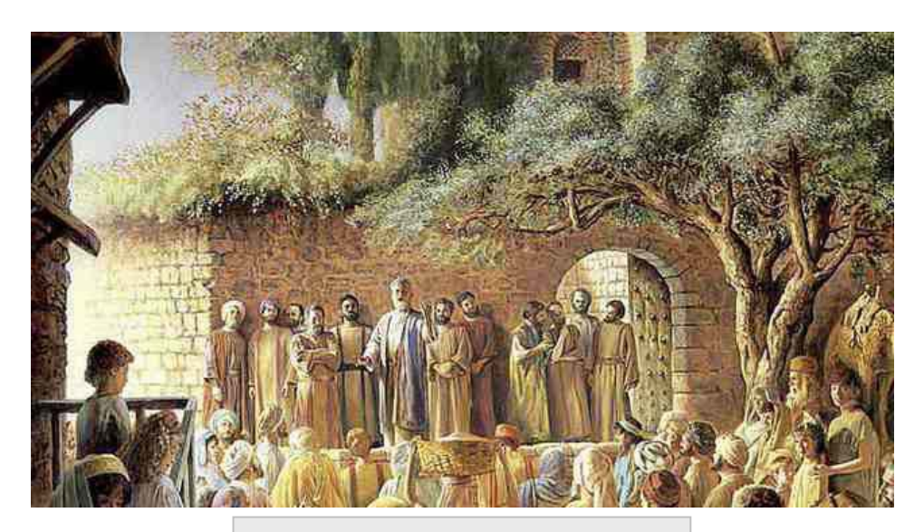
Acts 2 Pentecost and the preaching of Peter

21 And it shall come to pass, that whosoever shall call on the name of the Lord shall be saved.