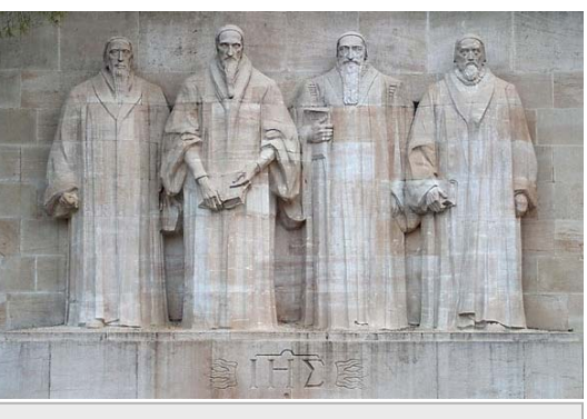
Reformation Wall in Geneva

The common denominator is the Protestant Reformation Church