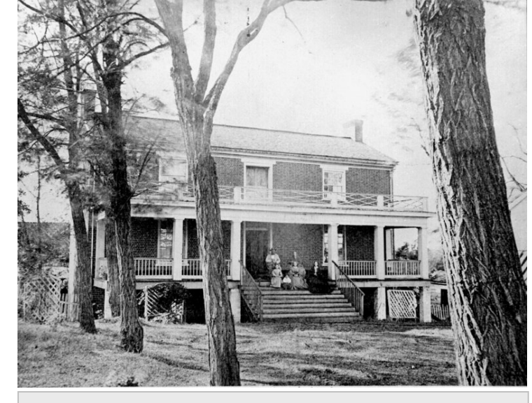
McLean House, April 1865

Joel 2:23 (KJV) Be glad then, ye children of Zion, and rejoice in the LORD your God: for he hath given you the FORMER RAIN moderately, and he will cause to come down for you the rain, the