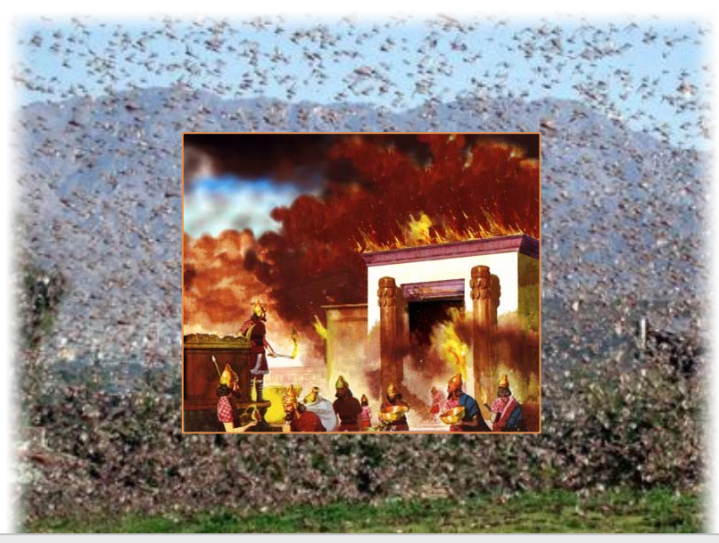
The locusts are in modern day Israel, with the picture in the midst being an artist's impression of Nebuchadnezzar's army attacking Jerusalem (though the illustration is of the attack on Jerusalem in 587-586 B.C., not 605 B.C.)

Key Understanding: The army of locusts against Judah – which represents an army of men – is an army of the Lord, in that the Lord ordained the army to judge Judah. Therefore, the Lord's "great army" in Joel 2:25 that is composed of the locust, cankerworm, caterpillar, and palmerworm – but is symbolic of an army of men, such as the army of Nebuchadnezzar's Babylon – is an army that is essentially in opposition to, and certainly not in harmony with, the bringing forth of the former rain and the latter rain seen in Joel 2:23, for the former rain and the latter rain are sent by the Lord to restore what the Lord's "great army" has destroyed.