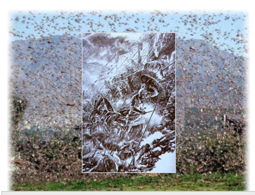
The locusts are in modern day Israel, with the picture in the midst being an artist's impression of Sennacherib's (locust) army battling in Lachish against Judea.

Because there are four different categories of devouring insects seen in Joel 1:4 – the palmerworm, the locust, the cankerworm, and the caterpillar – many have historically allegorized the four to represent Babylon (or the combination of Assyria-Babylon), Media-Persia, Greece, and Rome, overrunning Judah during the course of their respective empires. Others discount that concept, but, as to the identity of the locust army that devastates Judah, commentaries focus on (i) the army of Sennacherib, the Assyrian king from 705-681 B.C., who is known for his military