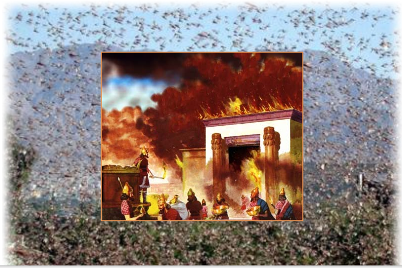
The locusts are in modern day Israel, with the picture in the midst being an artist's impression of Nebuchadnezzar's army attacking Jerusalem (though the picture is of the attack on Jerusalem in 586 B.C., not 605 B.C.)

The 605 B.C. Army <u>in contrast to</u> Joel's Latter Rain. Joel's Armies of Locusts that came upon Judah and Jerusalem included the pair of armies of Sennacherib's Assyria in 701 B.C., and particularly – since it was successful – Nebuchadnezzar's Babylon in 605 B.C. The Lord promised that he would send the <u>Latter Rain</u>, restoring the years of destruction that came as a result of <u>Nebuchadnezzar's 605 B.C. Locust Army</u>. [Note: It can be properly assumed that the 605 B.C. Locust Army of Nebuchadnezzar can by extension prophetically include the subsequent successful sieges of Jerusalem in 597 B.C. and 587-586 B.C. as well, resulting in the destruction of Jerusalem and Solomon's Temple. In other words, 605 B.C. was just the beginning, but it also represents the fullness and completeness of the destruction that would come upon Judah and Jerusalem.]