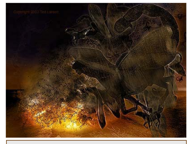
The shapes of the locusts were like unto horses prepared unto battle

8 And they had hair as the hair of women, and their teeth were as the teeth of lions.