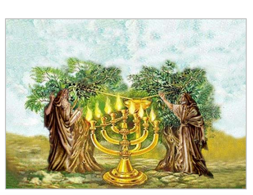
Zerubbabel and Joshua led the Jews out of the captivity of Babylon

4 So he said, "These are THE TWO [the governor, Zerubbabel, in the symbolic office of King , and Joshua in the office of Priest , guiding the people of Judah out of the captivity of Babylon, and into the building of the Temple] WHO ARE ANOINTED to serve the Lord of all the earth."