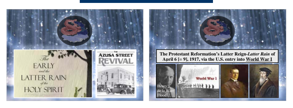
#1034 The Whore's Latter Rain – Zechariah Chapter 4 and the Latter Rain of April 9, 1906, and Latter Reign Page 2 of 3 of April 6, 1917, part 35, The Two Witnesses: Contrasting the outpouring of the double Latter Rains-Latter Reigns of April 9, 1906, and April 6, 1917, with the Latter Rains of the Two Olive Trees/Two Witnesses of Revelation 11