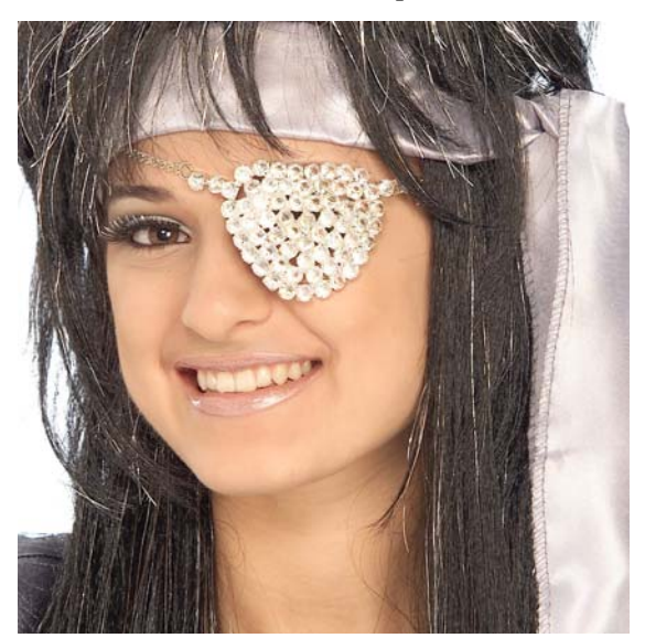
Think about the rhinestone eye patch and the Laodicean Church

20 Behold, I stand at the door, and knock: if any man hear my voice, and open the door, I will come in to him, and will sup with him, and he with me.