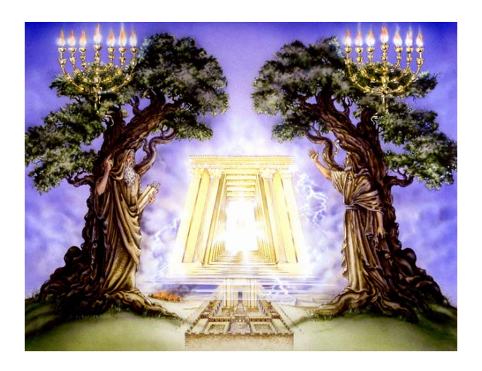
Zechariah 4:11-14 (NIV) Then I asked the angel, "What are these TWO OLIVE TREES on the right and the left of the lampstand?"

12 Again I asked him, "What are these TWO OLIVE BRANCHES beside the two gold pipes that pour out golden oil?"