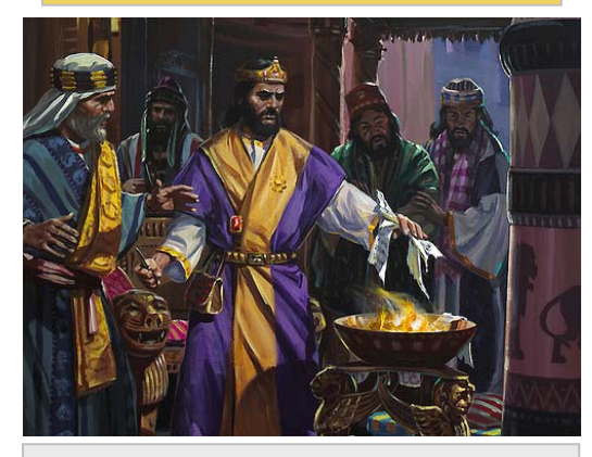
The second Eliakim, King Jehoiakim, burning Jeremiah's scroll, Jeremiah 36:23

The <u>second</u> Eliakim: He shall have <u>none to sit</u> <u>upon the throne</u> of David