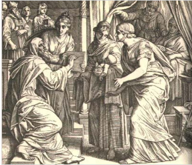
Zacharias names John

80 And the child [John the Baptist] grew, and waxed strong in spirit, and was in the deserts till the day of his shewing unto Israel.