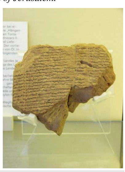
Babylonian clay tablet, unearthed near the Ishtar Gate, describing the rations meted out to prisoner King Jahukinu (Jehoiachin) of the land of Jahudu (Judah), confirming the Bible (2 Kings chapter 24)

[Jehoiachin apparently went out to meet the king of