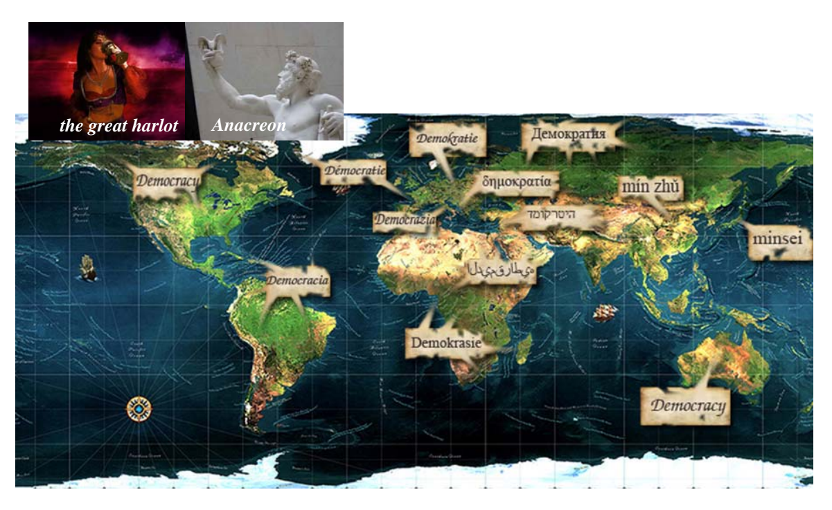
Revelation 17:2 (KJV) With whom the kings of the earth have committed fornication, and THE INHABITANTS OF THE EARTH HAVE BEEN MADE DRUNK WITH THE WINE OF HER FORNICATION.

Jeremiah 51:7 (KJV) <u>Babylon hath been a golden cup in the LORD'S hand, THAT MADE ALL THE EARTH DRUNKEN: THE NATIONS HAVE DRUNKEN OF HER WINE</u>; therefore the nations are mad.