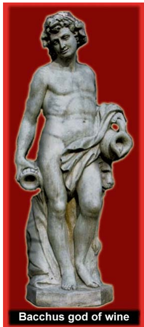
Bacchus god of wine

In truth, America is attached to the spiritual vine of the earth , nicely illustrated by the fact that the tune of “The Star-Spangled Banner” was taken from the English drinking song “To Anacreon in Heaven,” which, though it has the word heaven in its title, honors the Greek god of the grapevine of the earth and wine of the earth , Bacchus.