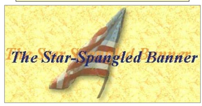
Francis Scott Key's day of the dawn's early light