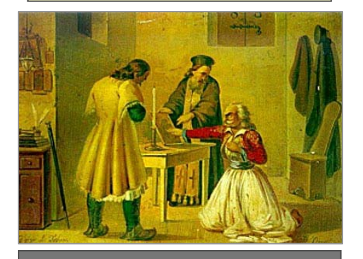
Oath of initiation into Filiki Eteria