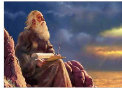
John on Patmos