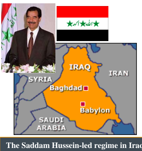
The Saddam Hussein-led regime in Iraq is the pretender Babylon the Great of Revelation 18

In the meantime, the United States is actually both the real Revelation 17 Scarlet Beast and the real Revelation 18 Babylon the Great: