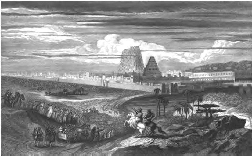
Jews in captivity being led into Babylon

The Book of Habakkuk contains only three short chapters. The period of the prophecy in the book has been dated anywhere from 650 B.C. to 600 B.C. Some say that the prophet Habakkuk lived in Judah toward the end of Josiah’s reign (640-609 B.C.) or at the beginning of Jehoiakim’s reign (609-598 B.C.), when the balance of power in the region was shifting from the Assyrians to the Babylonians, and that the prophecy in the Book of