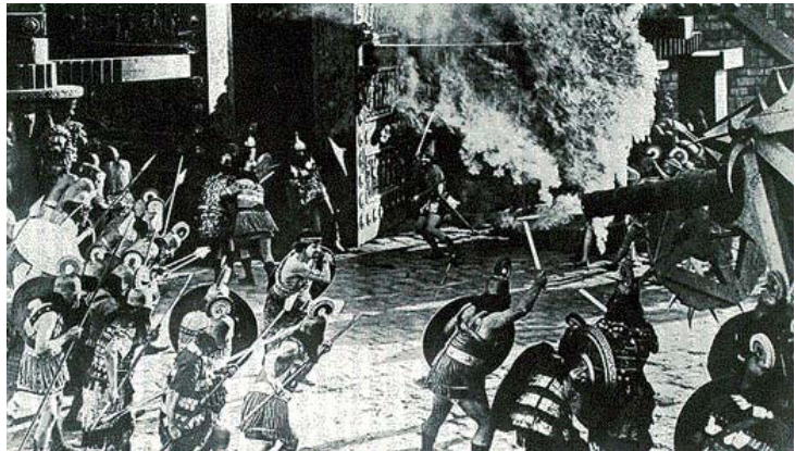
The Lord then judged Babylon through the hand of Media-Persia

8 Because you [Babylon] have plundered many nations, the peoples who are left will plunder you. For you have shed man's blood; you have destroyed lands and cities and everyone in them.