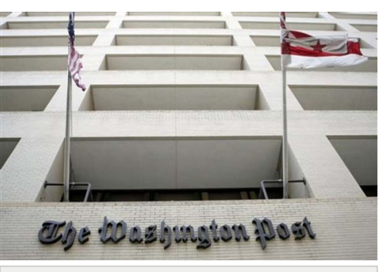
The Washington Post building in Washington D.C.

The media's The Washington Post. The Washington Post , founded in 1877, is the largest newspaper in Washington D.C. It is regarded as being among the leading daily American newspapers, along with The New York Times and The Wall Street Journal . The Washington Post has distinguished itself through its reporting on the workings of the White House, Congress, and other aspects of the U.S. government. Its most notable incident was when, in the early 1970's, Post reporters Bob Woodward and Carl Bernstein began the media's investigation of Watergate, which brought down the Nixon administration.