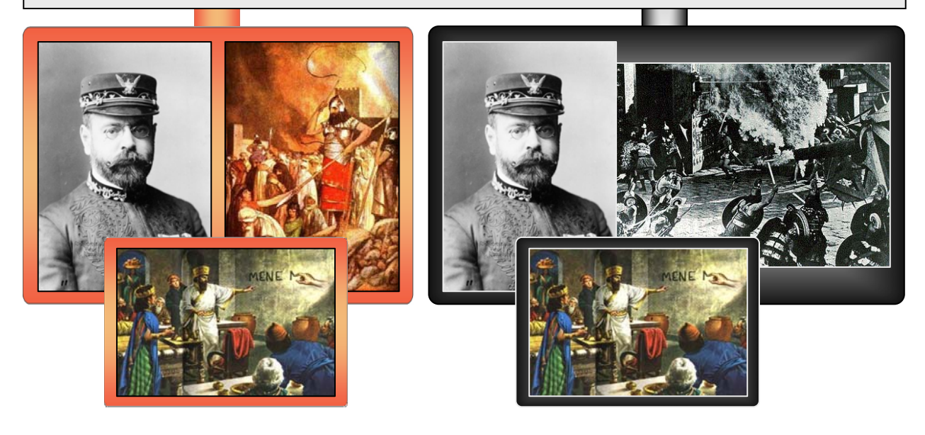
Habakkuk 1:6 (KJV) For, lo, I raise up the Chaldeans [Babylonians], that bitter and hasty nation, WHICH SHALL MARCH THROUGH THE BREADTH OF THE LAND [of Judah], to possess the dwellingplaces that are not theirs. {breadth: Heb. breadths} [NIV . . . I am raising up the Babylonians, that ruthless and impetuous people, who sweep across the whole earth to seize dwelling-places not their own.]

John Philip <u>Sousa's</u> death in <u>Reading</u>, Pennsylvania, on <u>March 6 (= Habakkuk 1:6)</u>, 1932, was prophetically connected to both <u>Babylon</u> and <u>Media Persia</u>, seen through the '<u>reading</u> the writing on the wall' story in Daniel 5