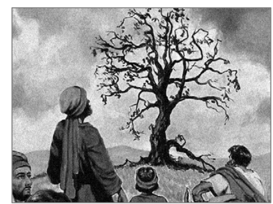
Tuesday – The disciples pass by the cursed fig tree and see that it has already died

cursed fig tree and see that it has already died (Matthew 21:20-22; Mark 11:20-24). On that day as well was what is known as the Olivet discourse. Jesus had departed from the temple and gone to the Mount of Olives. The disciples then asked