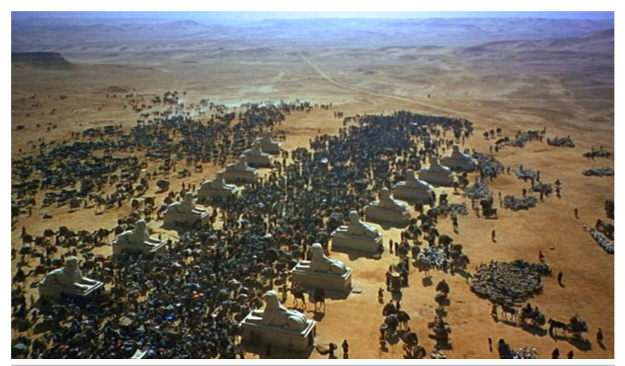
Israel's flight from Egypt as portrayed in Cecil B. DeMille's 1956 film The Ten Commandments

Exodus 12:30-39 (KJV) Pharaoh and all his officials and all the Egyptians got up during the night, and there was loud wailing in Egypt, for there was not a house without someone dead.