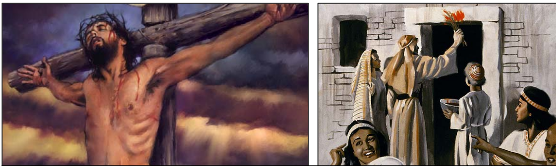
The drinking of the blood of Jesus Christ is associated directly with Passover

Key Understanding: The Old Testament Feast of the Passover (and Consecration of the Firstborn, which represents the Passover) and the Feast of Unleavened Bread are seen in the New Testament through Jesus' words in John 6:53-56. The drinking of the blood of Jesus Christ is associated directly with Passover (and the Consecration of the Firstborn, which represents the Passover), while eating the flesh of Jesus Christ directly reflects the Feast of Unleavened Bread .