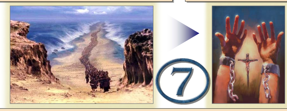
Therefore, it is proper to understand that a figurative , or unseen , Seal of God , or Mark of God , is placed upon the hand and/or forehead of the true believer and follower of Jesus Christ during New Testament times, as is seen in Revelation 7:3

... the <u>bread</u> [representing the body of Jesus Christ, which was broken for us] of the Lord's Supper (and Communion) represents the Lord's deliverance of his followers <u>out of the spiritual bondages of sin.</u>