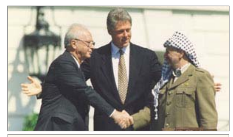
A picture of the famous handshake between Yitzhak Rabin and Yassir Arafat at the White House on September 13, 1993.

20, 1993, were prophetically linked together by the Lord. [These understandings will be expanded upon later.] The secret negotiations near Oslo would lead to the September 13, 1993, accord at the White House between the Palestine Liberation Organization (PLO), led by Yassir Arafat, and Israel, led by Prime Minister Yitzhak Rabin.