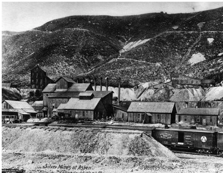
Silver mines at Aspen

Key Understanding: Aspen, the Silver City. Because the town of Aspen, Colorado – “the Silver City” – had at one time been home to the richest silver mine in the world, and had at one time supplied 1/6 of the silver in the United States and 1/16 of the world's total silver, the Lord ordained that Aspen would be at the center of the prophetic story of the United States being the silver kingdom of Media-Persia in its defeat of Saddam Hussein in the 1991 Gulf War.