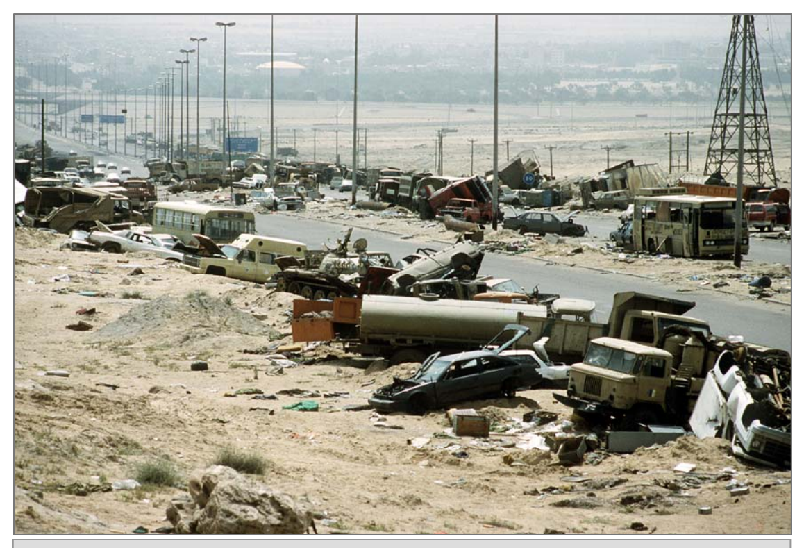
Demolished vehicles line Highway 80, also known as the "Highway of Death," the route fleeing Iraqi forces took as they retreated from Kuwait during Operation Desert Storm

<u>Click here</u> for #1371–Doc 1 <u>Click here</u> for the Original Source of #1371–Doc 1