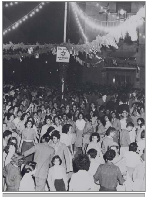
Crowds in Tel Aviv celebrate Independence Day

May 15, 1948, Arab armies attack Israel. Arab states issued their response statement and Arab armies, chiefly from Egypt, Syria, Lebanon, Iraq, and Jordan (called Transjordan until 1949), attacked Israel, aiming to destroy the new nation. [By early 1949, Israel had defeated the Arabs and gained control of about half the land planned for the new Arab state. Egypt and Jordan held the rest of Palestine. Israel controlled the western half of Jerusalem and Jordan held the eastern half. Israel incorporated the gained territory into the fledgling country, adding about